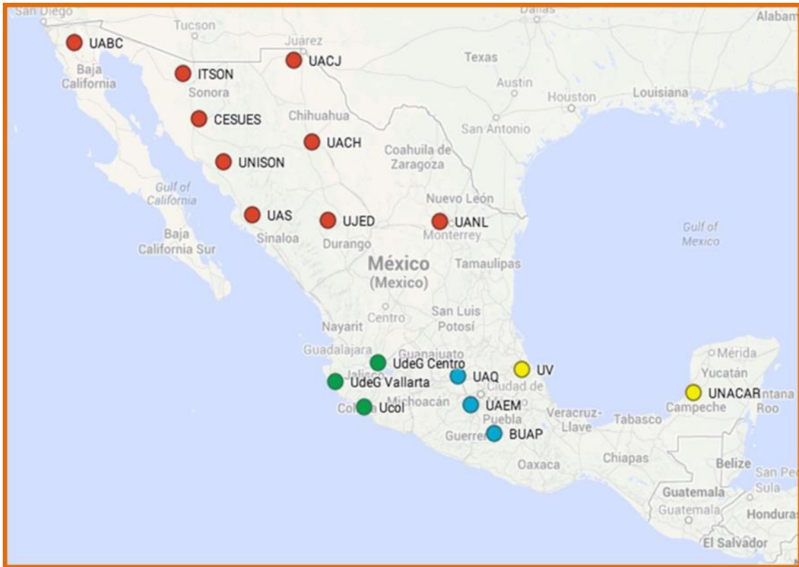
Figure 2 — Geographical location of Mexican Higher Education Institutions of Physical Culture Association C.A. that offer degree options related to Physical Education and Sport. Notes. 1. Miguel Herrera coach of the Mexican National soccer team from October 2013 to July 2015 earned $2.7 million US dollars annually. 2. NSI aims to promote and strengthen through assessment scientific and technological quality research and the innovation that occurs in the country. The system contributes to the formation and consolidation of researchers with scientific and technological knowledge at a highest level as a fundamental element to increase culture, productivity, competitiveness and social welfare.